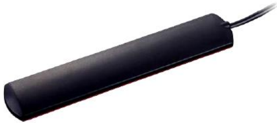
Antenna LTE Adhesive 017L, 2 dBi, SMA(m), RG174/3m